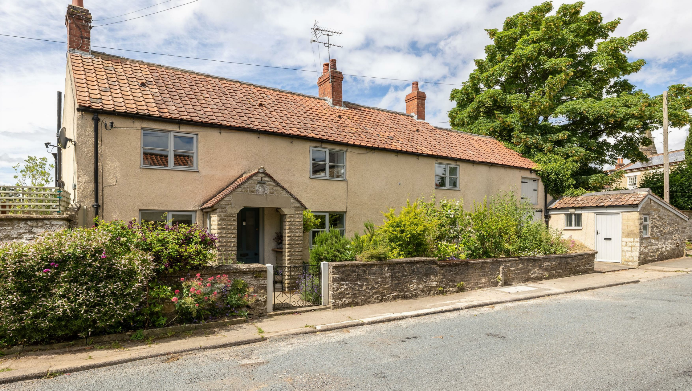
Gale House Gale Lane | York